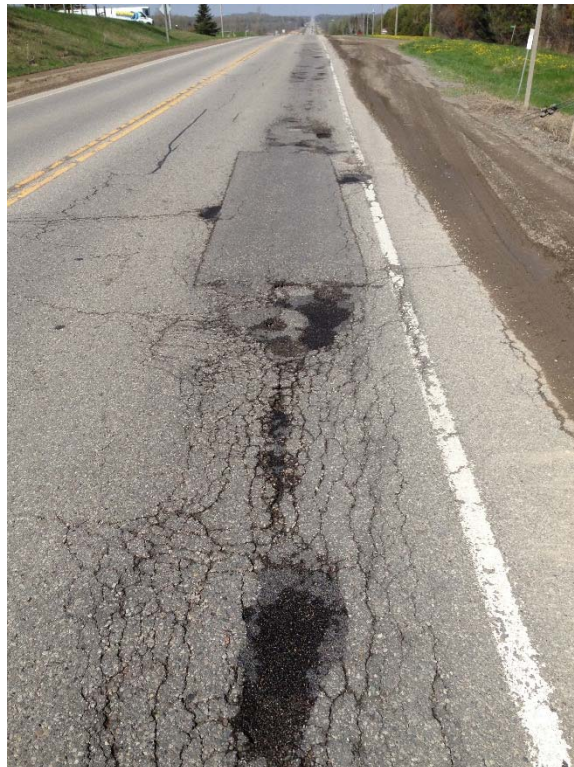
Figure 2-Typical County Road #109 Deterioration