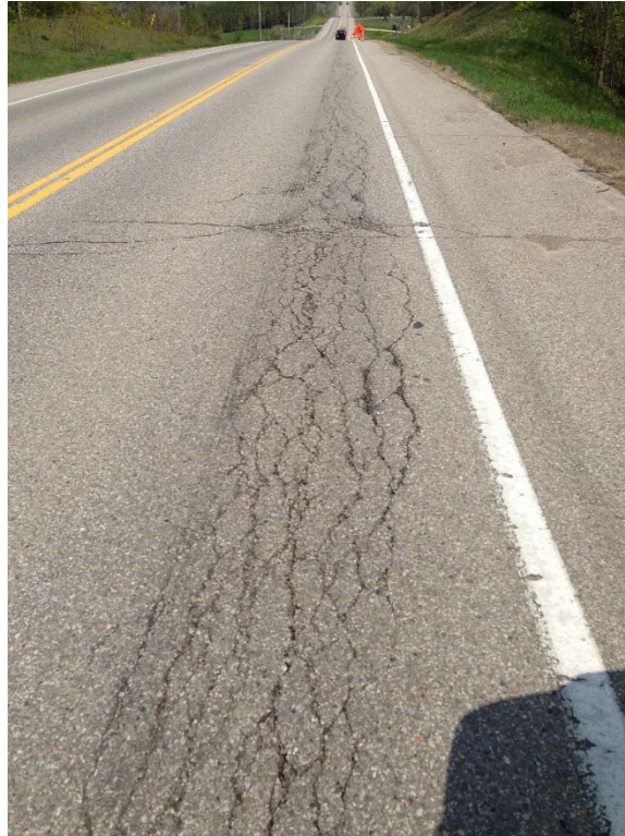
Figure 1-Typical County Road #18 Deterioration