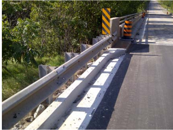
Figure 26: Asphalt approach and Guide Rail