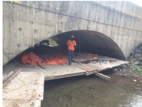
Figure 12: Out of Water Platform