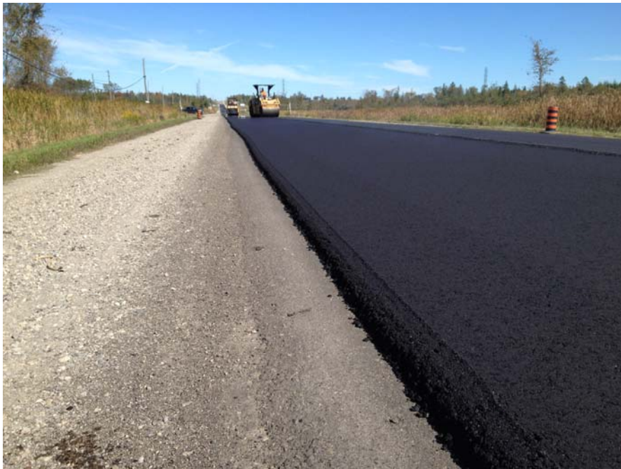
Figure 8: Surface Asphalt