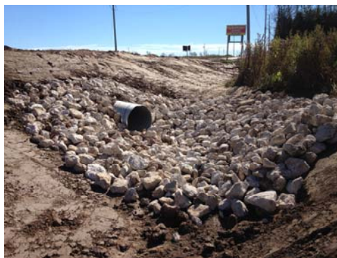
Figure 6: Erosion Protection