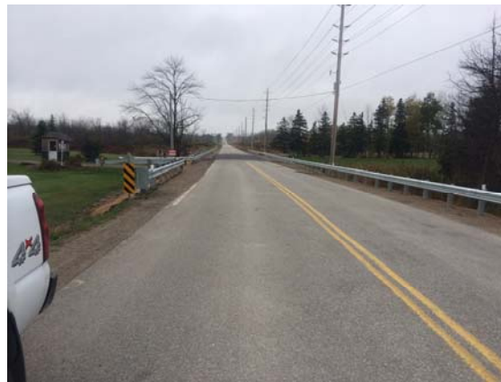
Figure 17: Guide Rail