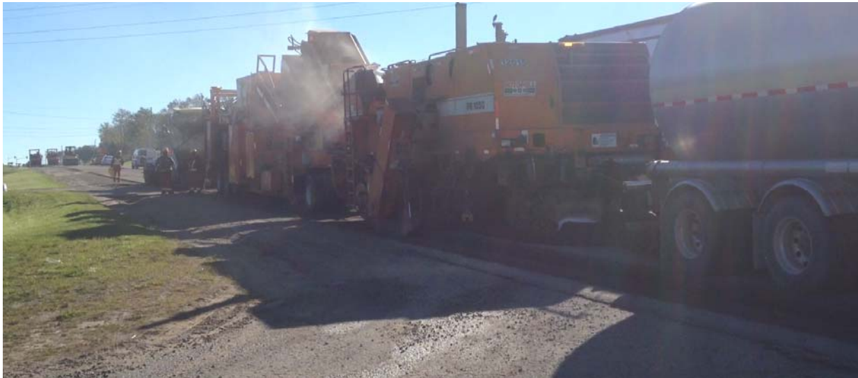
Figure 7: Cold in Place Recycling