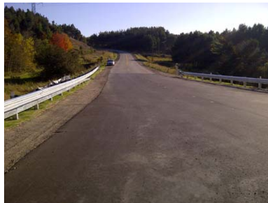
Figure 14: Surface Asphalt