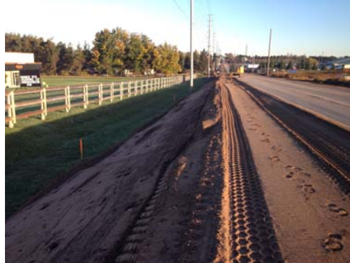
Figure 2: Road Widening