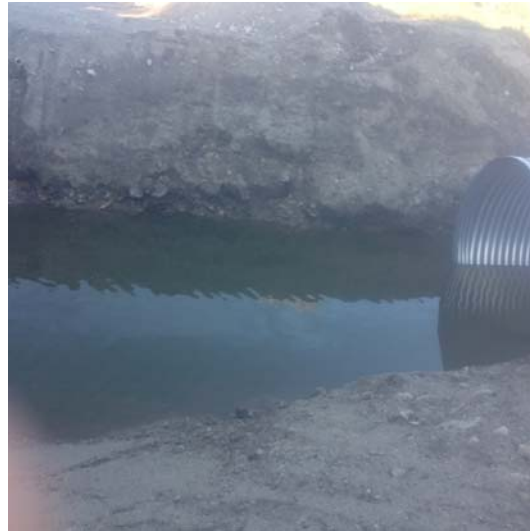
Figure 22: Saturated excavation