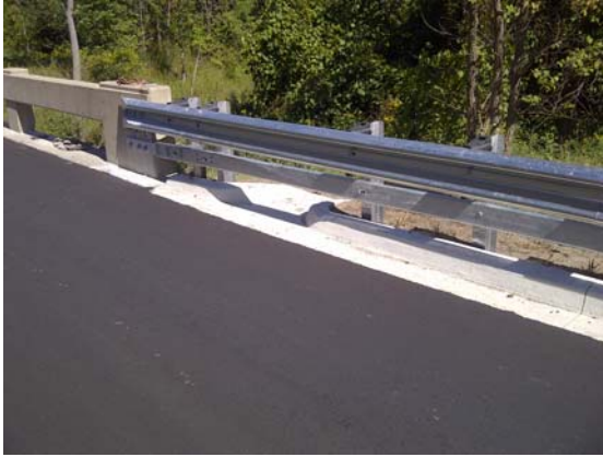
Figure 9: Curb and Guide Rail