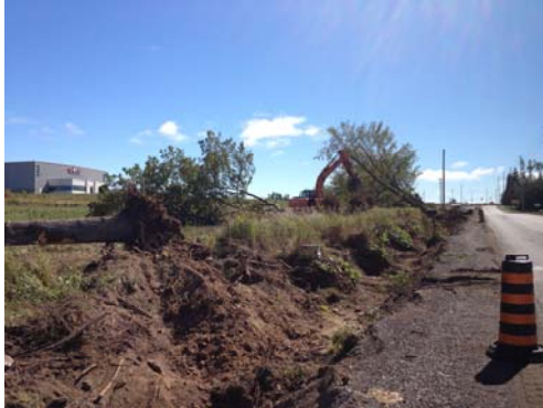
Figure 1: Clearing and Grubbing