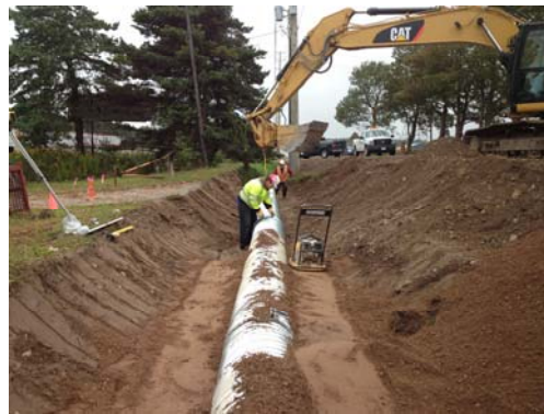
Figure 4: Culvert Replacement