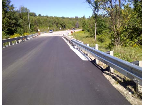
Figure 10: Surface Asphalt