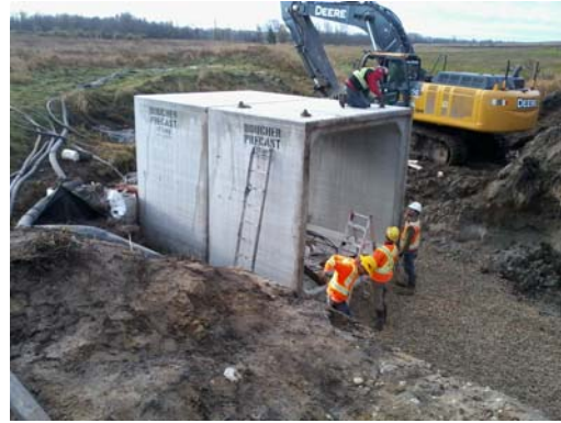
Figure 16: Placement of Concrete Box Culvert