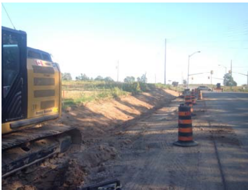
Figure 3: Ditch Work, Intersection of County Rd. 109 and County Rd. 11