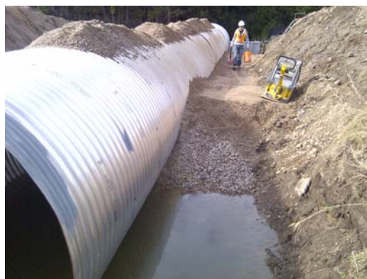
Figures 23 and 24: Compaction Testing of Granular Bedding and Backfill