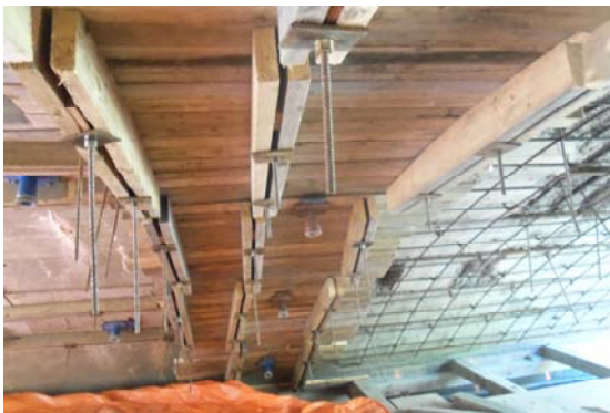
Figure 11: Concrete Forming