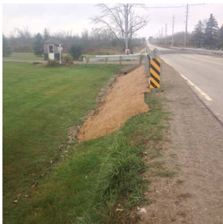
Figure 18: Slope Stabilization