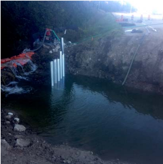
Figure 21: Dewatering