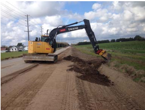
Figure 5: Topsoil Restoration