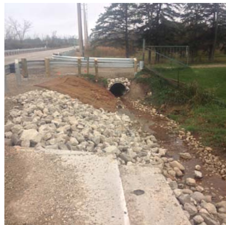
Figure 19: Guide Rail Driveway Returns and Erosion Protection