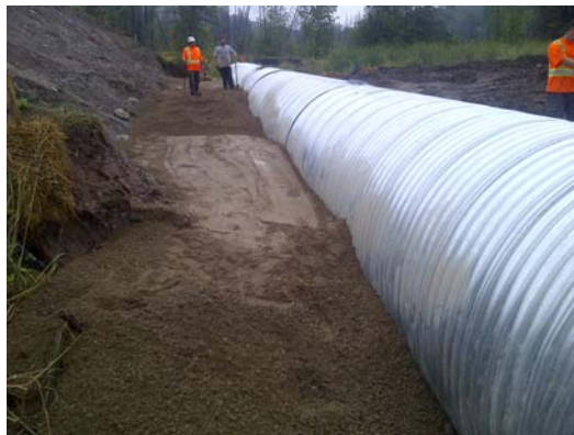
Figure 13: Culvert installation