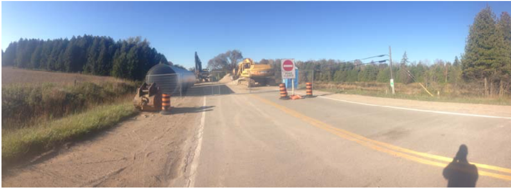
Figure 20: Road Closure, and New Culvert