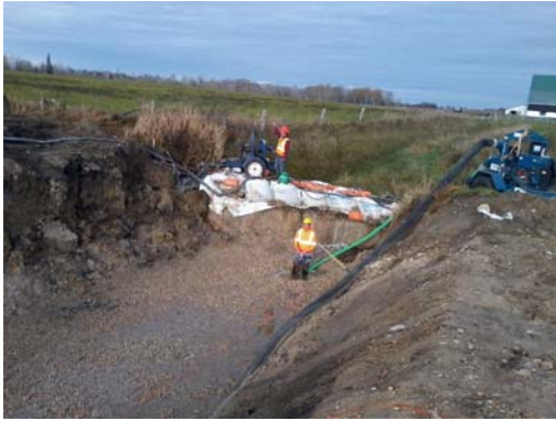
Figure 15: Dewatering