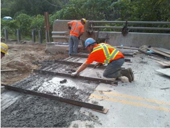
Figure 25: Deck Surface repairs