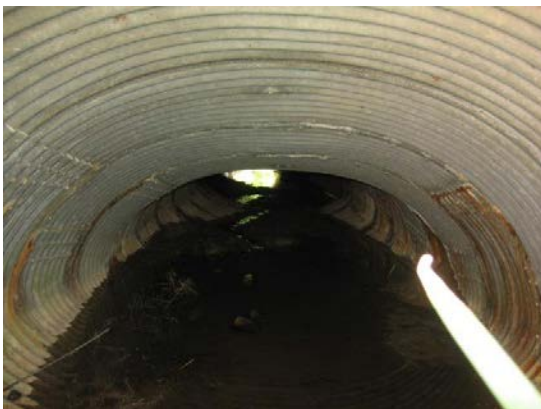
Figure 5: General Barrel View