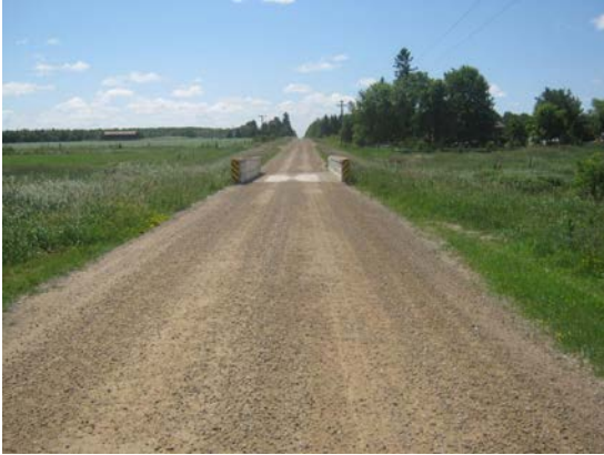
Figure 7: Profile View