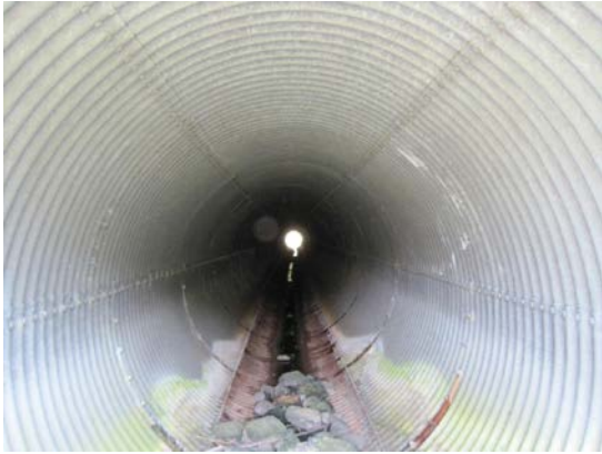
Figure 1: General Barrel View