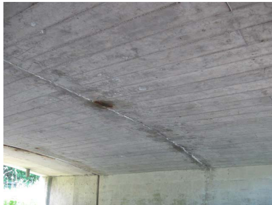
Figure 4: General Soffit