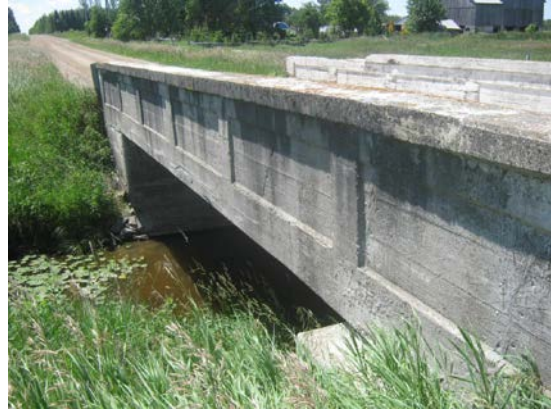
Figure 8: Elevation View