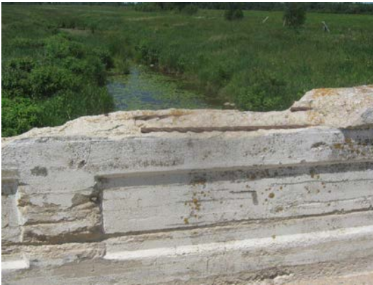
Figure 9: Parapet Wall Deterioration