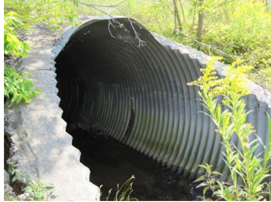
Figure 2: Outlet View