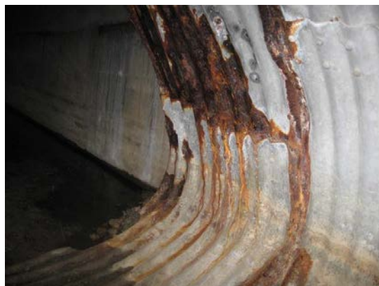
Figure 6: Barrel Rust and Corrosion