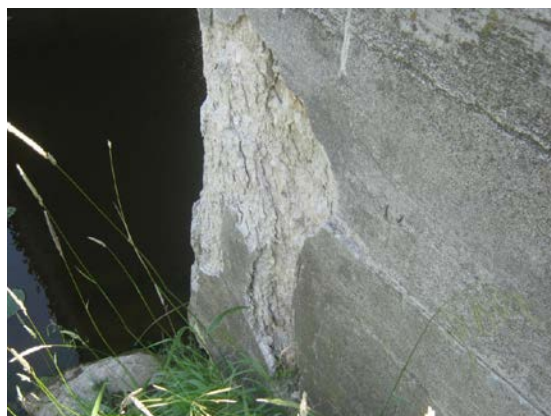
Figure 10: Wingwall Deterioration