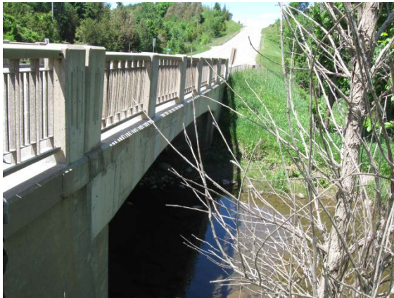
Figure 3: Elevation View