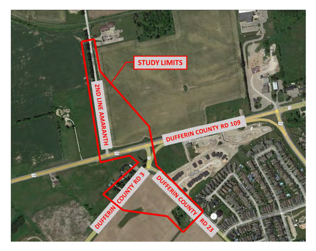
FIGURE 1 – STUDY AREA

The field observations were conducted on May 12th, 2023, within the Study Area. A total of 35 individual trees and 209 trees in 13 tree groupings were assessed for this memo.