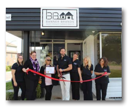
Develop the Economic Development Strategy and Action Plan