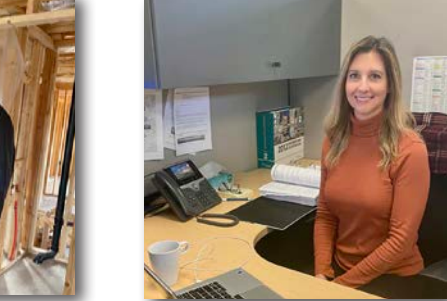
Special Project: Review and Close all Inactive Building Permits