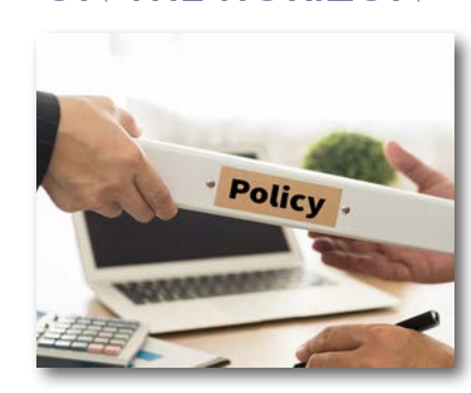
Development Review and Approval Policy Creation