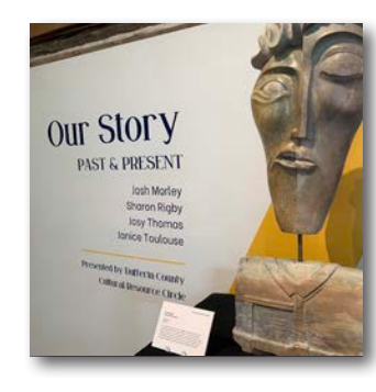
New Program, Tour and Event Plan