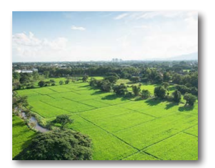
Establishing a Development Application Tracking Tool