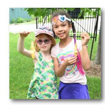
Implementing In- School Programs