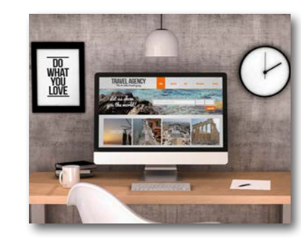
Tourism Website Development