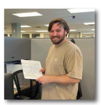
Customer Service Feedback Process